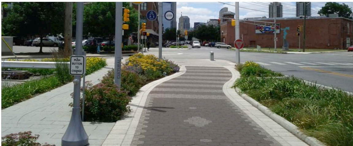
Indianapolis, by Eric Fischer

Planning and designing our streets for people on foot, in addition to those traveling by public transportation, bicycle and automobile, is the most important approach to improving street safety. Without sidewalks, safe and convenient street crossings, and slower design speeds, no amount of programmatic or regulatory efforts will curb the epidemic of pedestrian deaths.