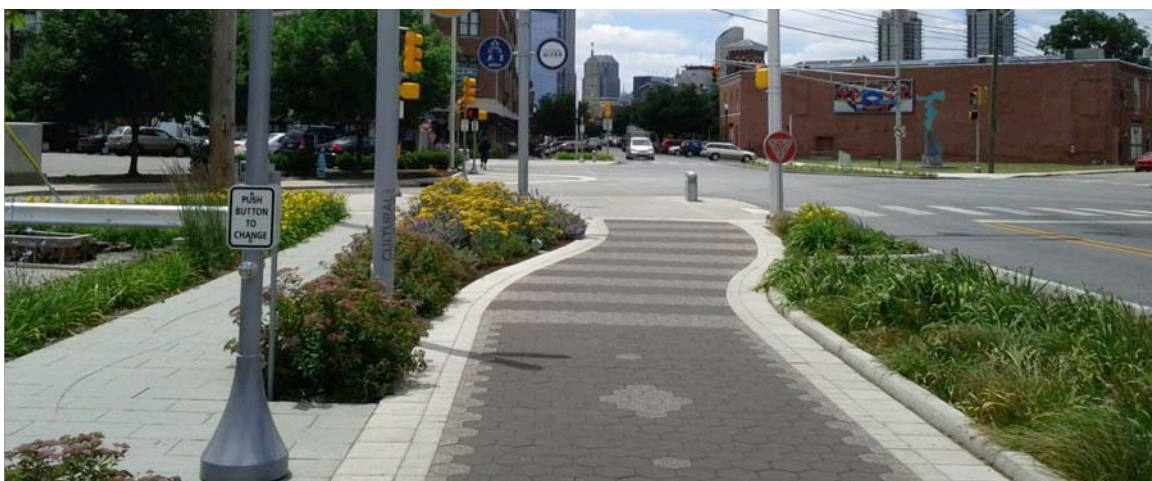
Indianapolis, by Eric Fischer

Planning and designing our streets for people on foot, in addition to those traveling by public transportation, bicycle and automobile, is the most important approach to improving street safety. Without sidewalks, safe and convenient street crossings, and slower design speeds, no amount of programmatic or regulatory efforts will curb the epidemic of pedestrian deaths.