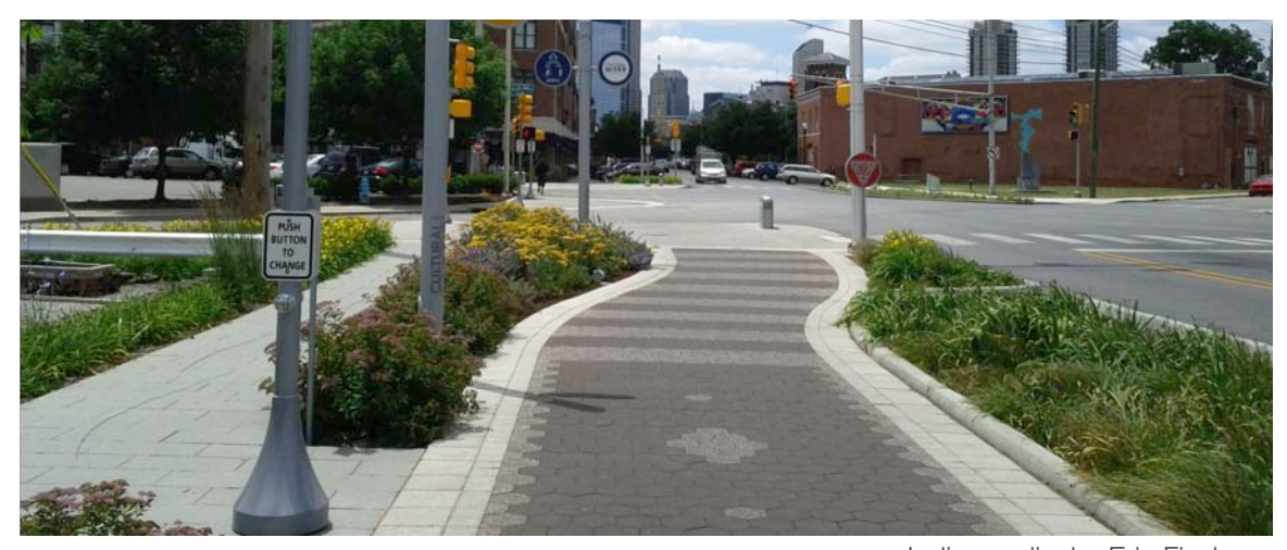
Indianapolis, by Eric Fischer

Planning and designing our streets for people on foot, in addition to those traveling by public transportation, bicycle and automobile, is the most important approach to improving street safety. Without sidewalks, safe and convenient street crossings, and slower design speeds, no amount of programmatic or regulatory efforts will curb the epidemic of pedestrian deaths.