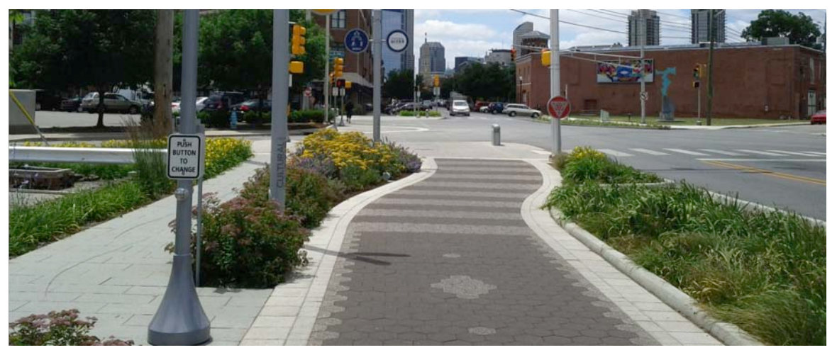
Indianapolis, by Eric Fischer

Planning and designing our streets for people on foot, in addition to those traveling by public transportation, bicycle and automobile, is the most important approach to improving street safety. Without sidewalks, safe and convenient street crossings, and slower design speeds, no amount of programmatic or regulatory efforts will curb the epidemic of pedestrian deaths.