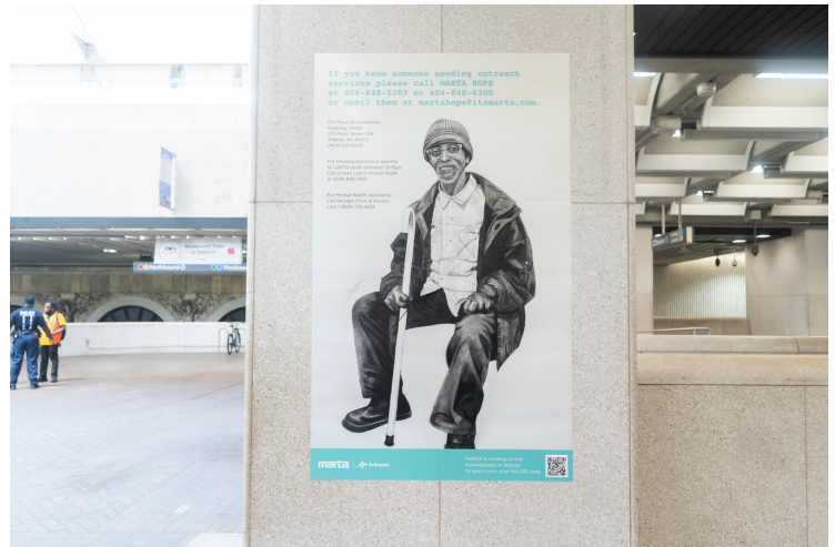
Poster from MARTA project