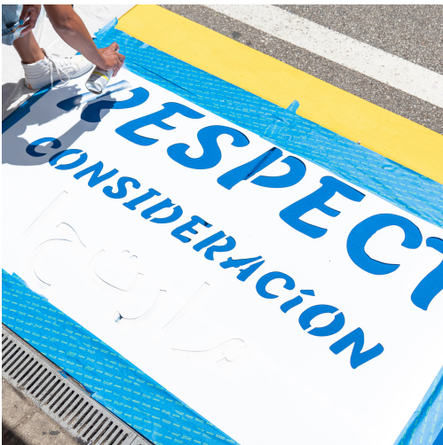
Mural process