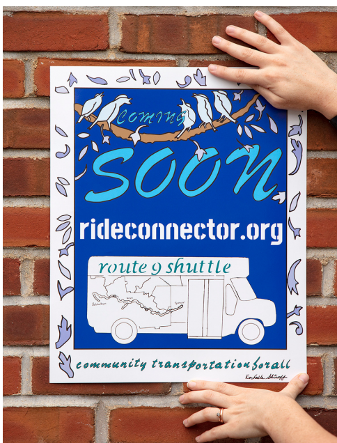
Coming soon posters

The Quaboag Valley Community Development Corporation (QVDC) and the Town of Ware, MA launched a pilot shuttle to complement its current demand-response ride service, the Quaboag Connector. Through this new service, QVDC wishes to address public transportation as a social determinant of public health and social equity.