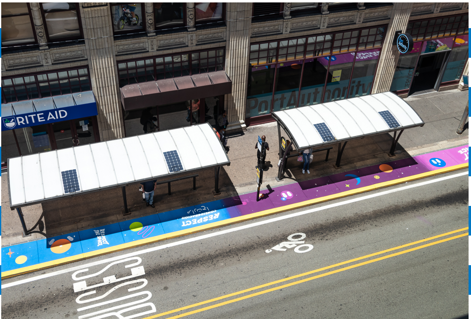
"Respect the Space" mural